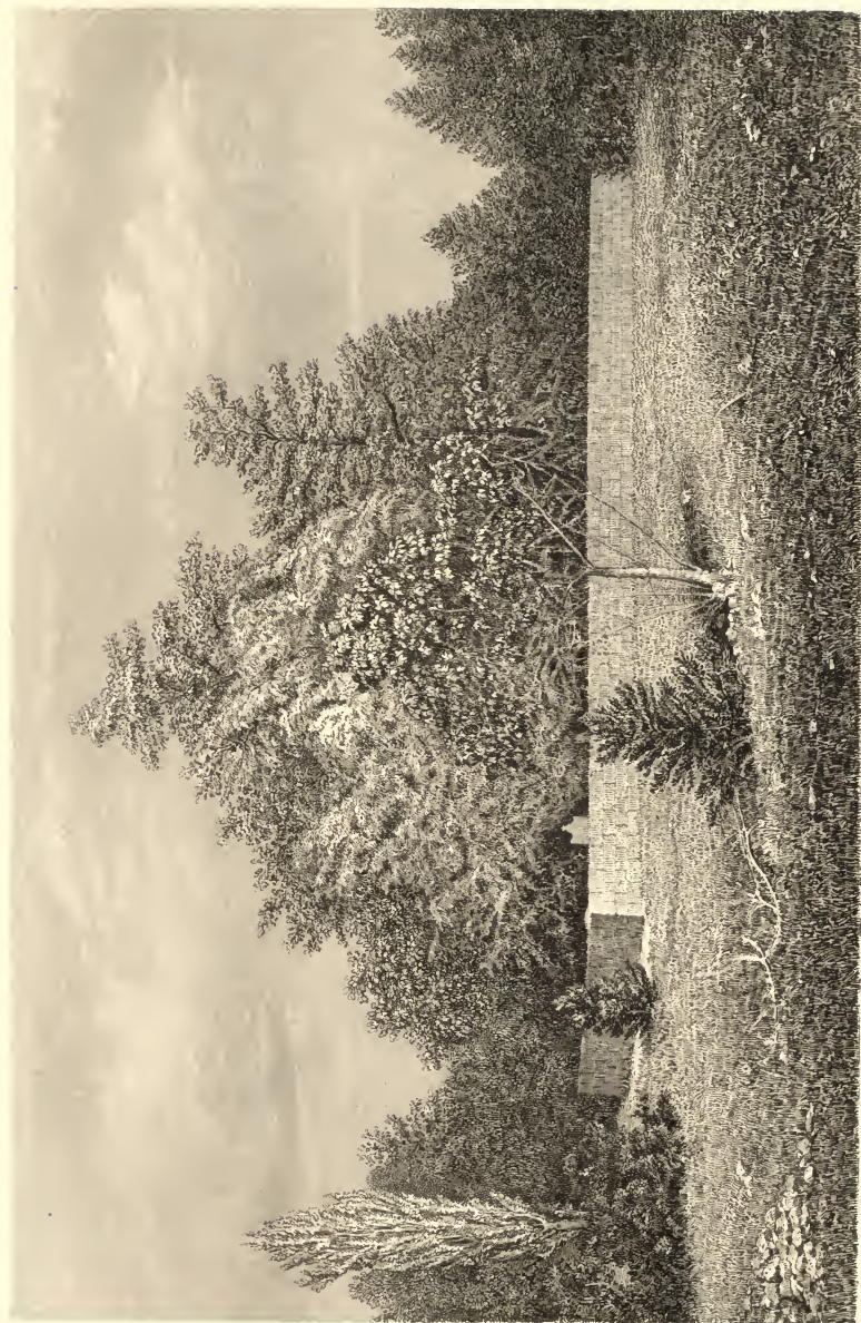
Howard House, West Branch, Maryland